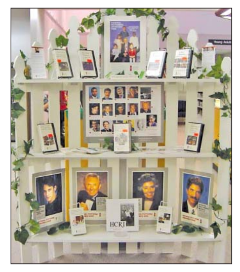
SFA material received special attention at the Rensselaer (Ind.) Public Library.