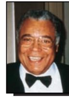
James Earl Jones