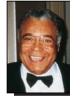
James Earl Jones