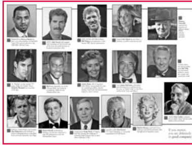
The 16 Famous People Who Stutter poster is available online at www.stutteringhelp.org or call 1-800-992-9392.