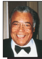
James Earl Jones