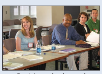
Participants hard at work.