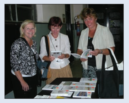
Speech therapists look over Stuttering Foundation materials.