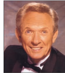
Country music star and recording artist Mel Tillis has entertained audiences across the country and around the world.