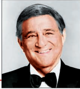
Robert Merrill , world-famous baritone, was the first American to sing 500 performances with the Metropolitan Opera.