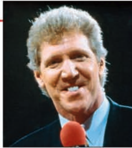
NBA All Star and Hall of Famer Bill Walton is recognized as a well-known NBC Sports commentator.