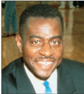
Bob Love , legendary star of the Chicago Bulls, now heads up Community Affairs for the championship team.