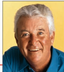
Legendary golfer Ken Venturi , U.S. Open champion, is a successful commentator for CBS Sports.