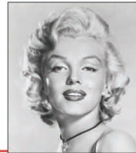
Marilyn Monroe captivated movie audiences and fellow performers alike throughout her legendary career.