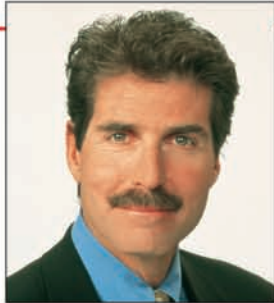
2020's John Stossel still struggles with stuttering, yet has become one of the most successful reporters in broadcast journalism today.