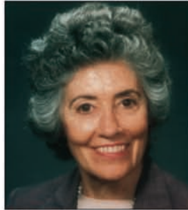
Annie Glenn , wife of astronaut John Glenn, was grounded for years by a stuttering problem. Speech therapy, hard work and determination helped to turn it around.