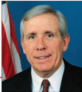
Congressman Frank Wolf of Virginia feels that meeting the challenge of stuttering helped prepare him to meet other challenges in life.