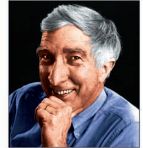
Author John Updike continues his successful career with best-sellers Rabbit at Rest , Brazil , and Villages .