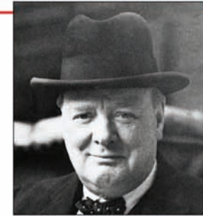
Winston Churchill captured the attention of millions during WWII with his inspiring speeches.