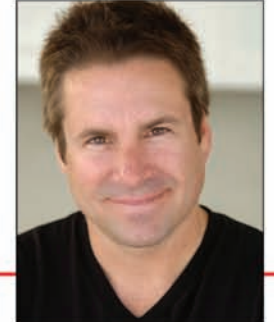
John Melendez , announcer for the Tonight Show , is a talented musician, actor, and comedian.