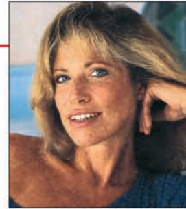
Singer Carly Simon , winner of an Oscar and a Grammy, not only has many hit records but is also an author of children's books.