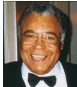
Actor James Earl Jones , a Broadway and television star, is well-known for his voice as "Darth Vader" in Star Wars and his book, Voices and Silences .