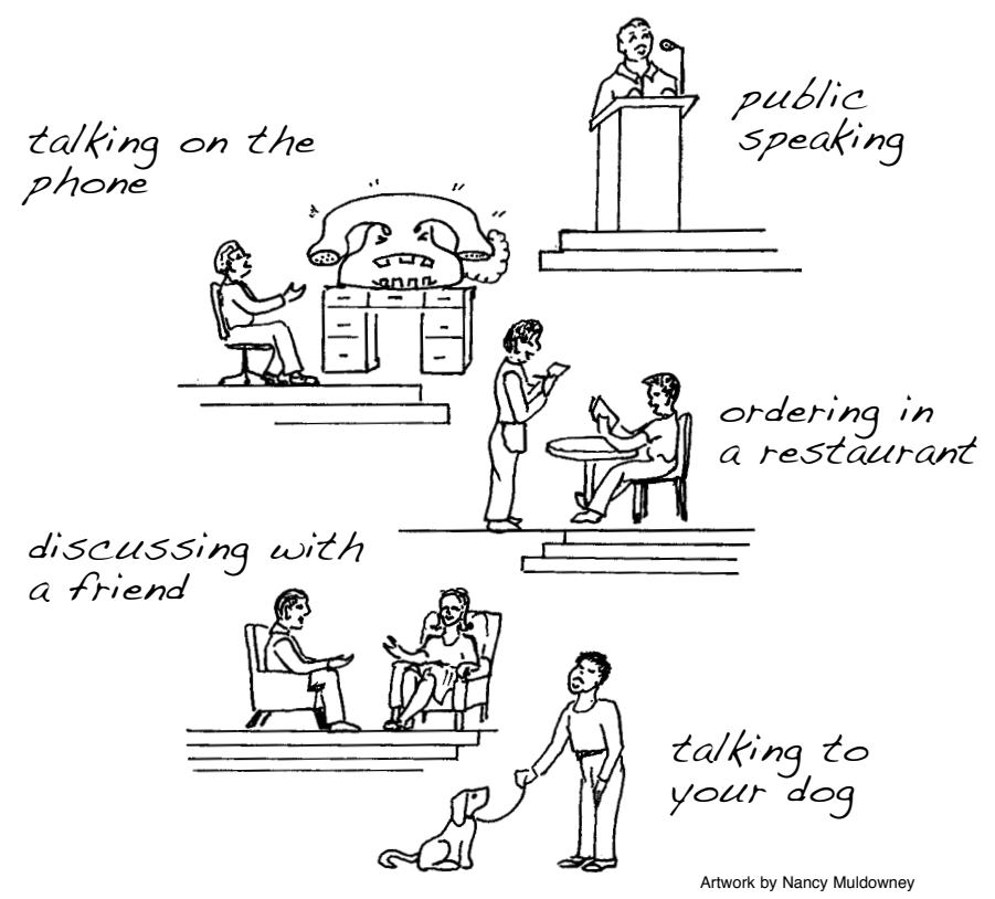
A hierarchy going from easier situations to harder ones.

You will need to develop your own hierarchy as the points listed here may not be right for you.