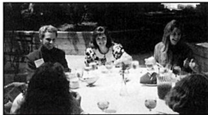
Animated conversation at lunch.