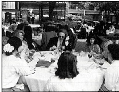
Participants exchange ideas over lunch on the terrace overlooking the mountains.