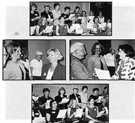
Workshop graduates at closing ceremony.

workshop are provided by the Stuttering Foundation.