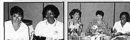
Attendees continue discussions during luncheons.