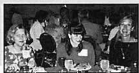
Attendees continue discussions during luncheons.