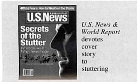
U.S. News & World Report devotes cover story to stuttering

Illustrations, such as the brain PET scans, gave readers special insights into the challenges that scientists face to solve the mystery of stuttering.