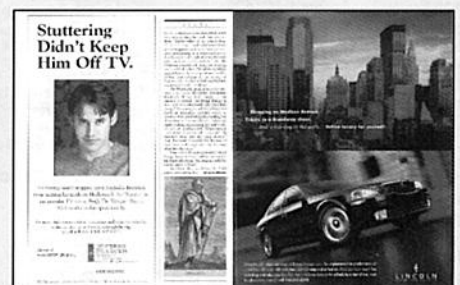
Time magazine public service ad featuring Nicholas Brendon, Summer 2001.